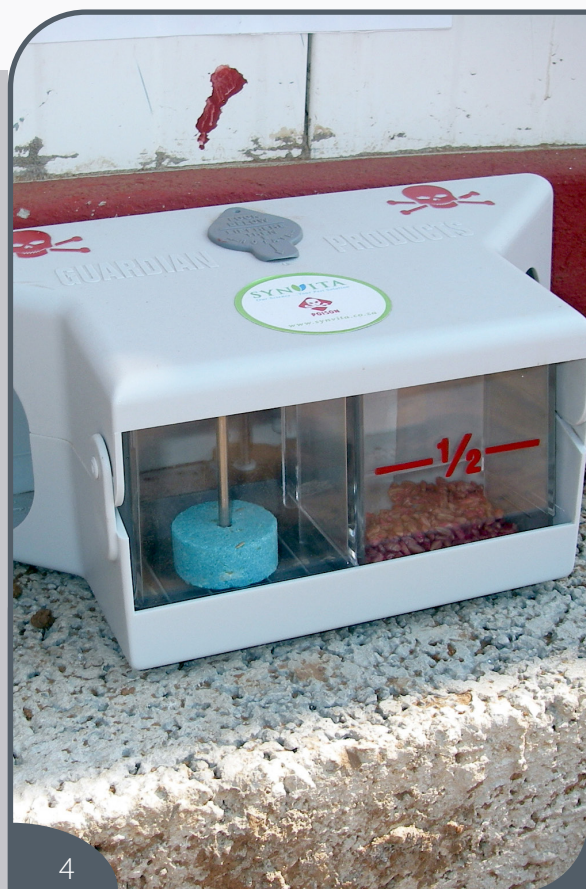
4 Bait station placed near an outside wall.