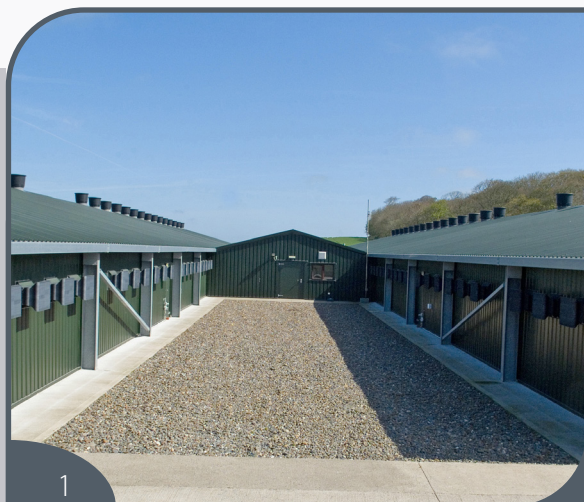
1 Eliminate vegetation for 1 m (3 ft) between houses and add gravel to deter rodents.