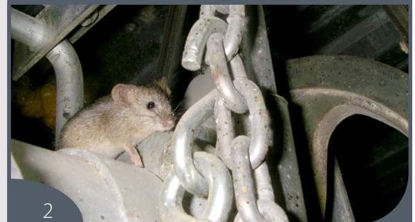
2 Live rodent sighting.