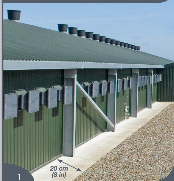
1 House aprons should extend at least 20 cm (8 in) outward.