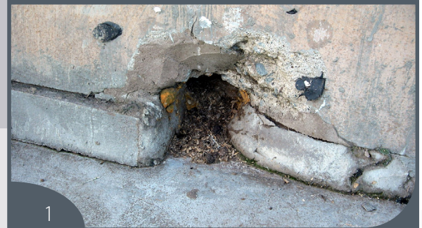
1 Burrows in house foundation.