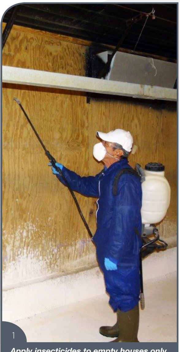
Apply insecticides to empty houses only.